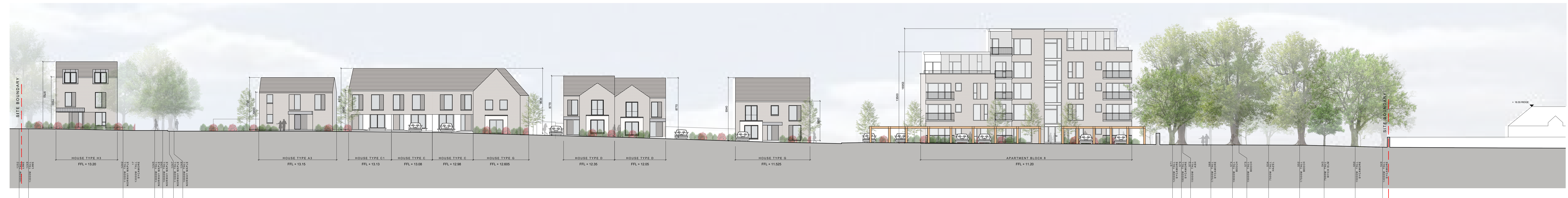
SITE SECTION H - H SCALE: 1:200 NOTE: SEE LANDSCAPE ARCHITECTS DRAWINGS FOR BOUNDARY TREATMENTS SEE ARBORISTS REPORT FOR DETAIL ON EXISTING TREES DOTTED RED LINE INDICATES SITE BOUNDARY