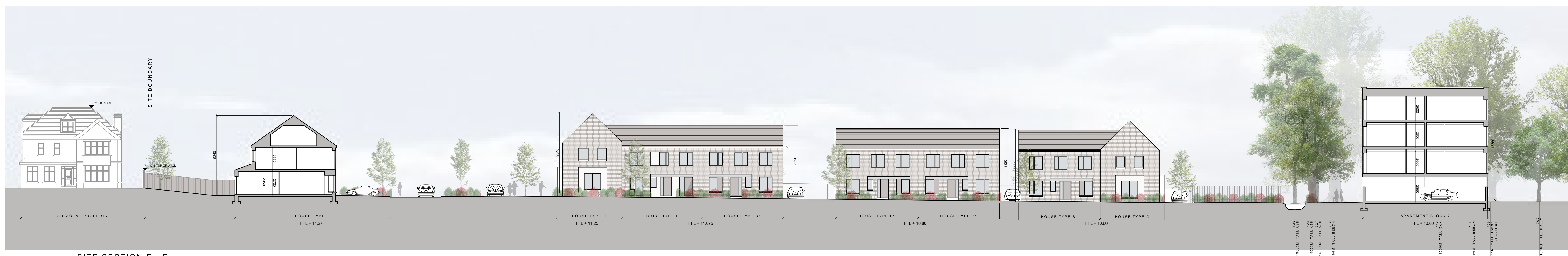
SITE SECTION F - F SCALE: 1:200 NOTE: SEE LANDSCAPE ARCHITECTS DRAWINGS FOR BOUNDARY TREATMENTS SEE ARBORISTS REPORT FOR DETAIL ON EXISTING TREES DOTTED RED LINE INDICATES SITE BOUNDARY