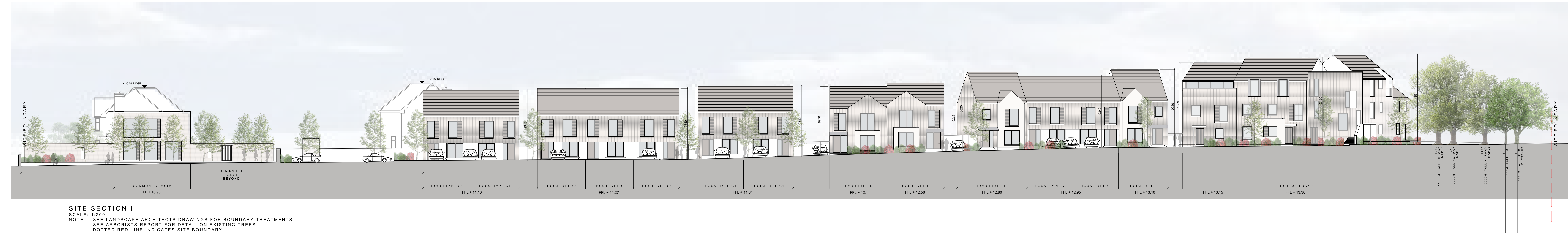
SITE SECTION I - I SCALE: 1:200 NOTE: SEE LANDSCAPE ARCHITECTS DRAWINGS FOR BOUNDARY TREATMENTS SEE ARBORISTS REPORT FOR DETAIL ON EXISTING TREES DOTTED RED LINE INDICATES SITE BOUNDARY