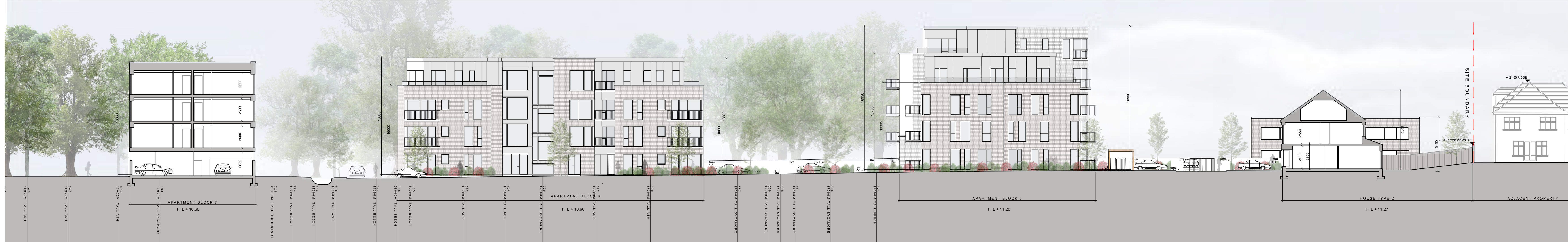
SITE SECTION G - G SCALE: 1:200 NOTE: SEE LANDSCAPE ARCHITECTS DRAWINGS FOR BOUNDARY TREATMENTS SEE ARBORISTS REPORT FOR DETAIL ON EXISTING TREES DOTTED RED LINE INDICATES SITE BOUNDARY